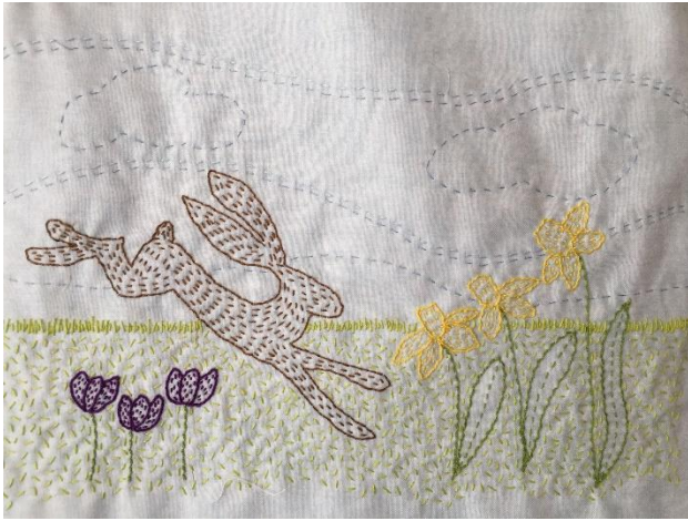
Shiona started this at an Angela Daymond workshop. The background is a pale blue rather than grey.